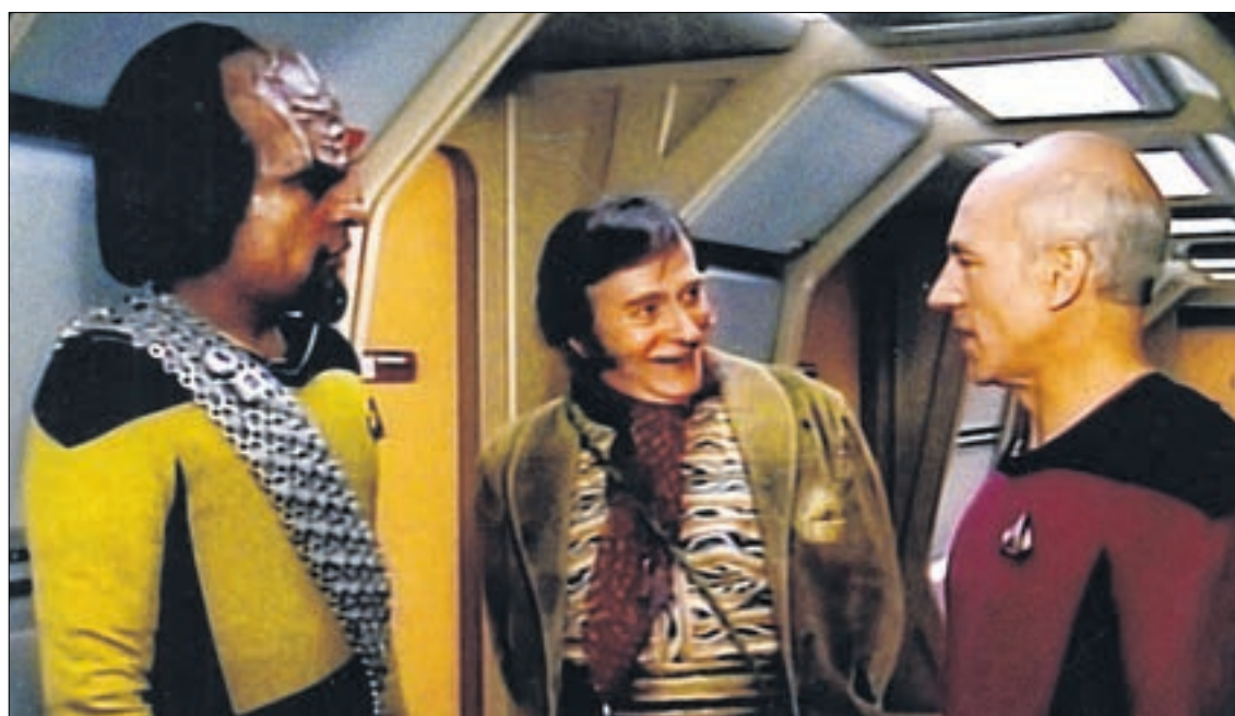
The "Star Trek" voyager: In one memorable "Next Generation" episode, Barrie Ingham (center) journeys into TV space with his old pal, fellow Shakespearean actor Patrick Stewart, who beat out Ingham for the part of Capt. Picard. Ingham is one of a handful of actors who has appeared in both "Doctor Who" and "Star Trek," making him a popular celebrity guest at sci-fi conventions.