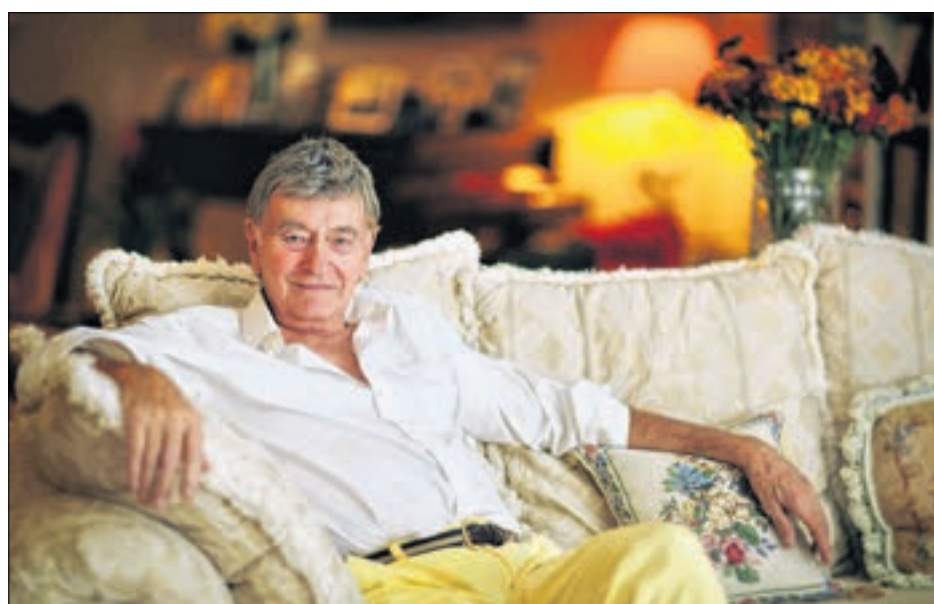
The actor at home: “What is an actor? A person with excessive vitality prepared to sell it at a price to those with less vitality... It’s a life force.”